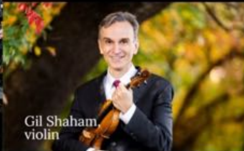
Gil Shaham violin